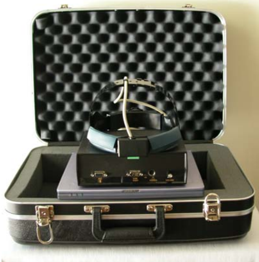
Figure 1. VAT system in a padded case for portability. The instrumented head band connects to an interface box, which is linked to a notebook PC through a USB or serial port.

The VAT system has evolved with new software and hardware innovations over the past 15 years. The VAT in 2002 consists of an instrumented head band worn by the patient, a control box interfaced through a serial or USB port to a notebook PC, and Windows-based software for conducting tests, displaying and printing results, and summarizing reports for a patient's chart (Fig. 1). A foam-padded case is used to transport the equipment to different test sites, such as a hospital bedside, for portable testing.